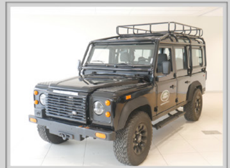
1993 LAND ROVER DEFENDER 110