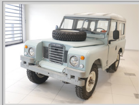
1974 LAND ROVER DEFENDER 110