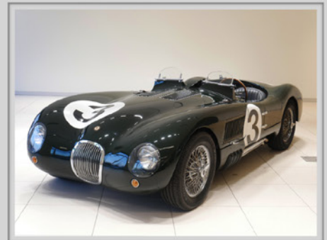
1951 JAGUAR C TYPE REPRODUCTION