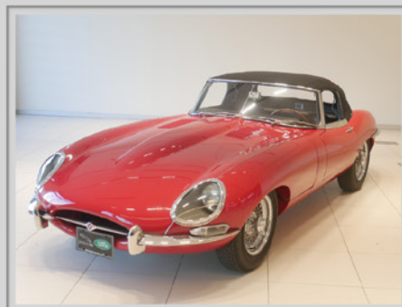
1964 JAGUAR XKE