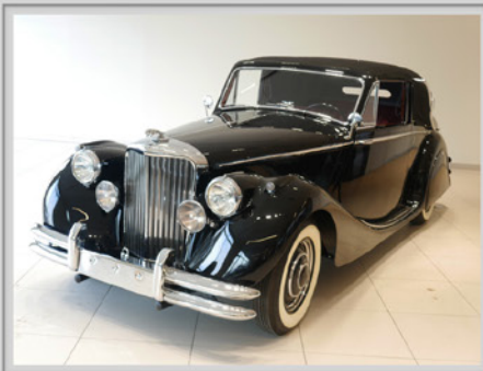
1950 JAGUAR MARK V CONVERTIBLE