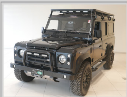
1988 LAND ROVER DEFENDER 110