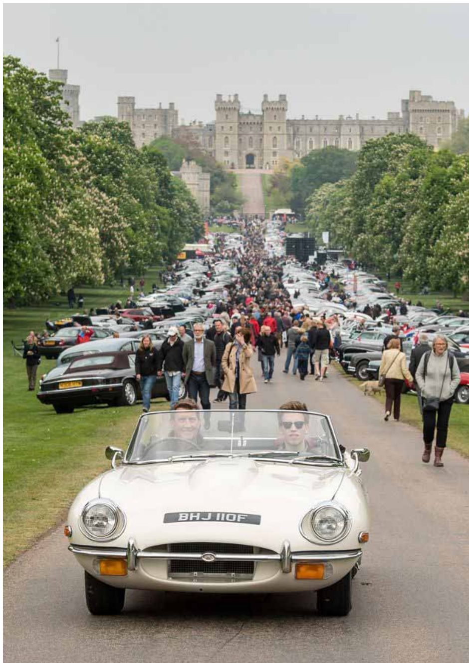
Jags at Windsor