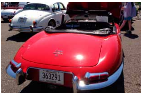
67 Mark II and E-type opposite view.