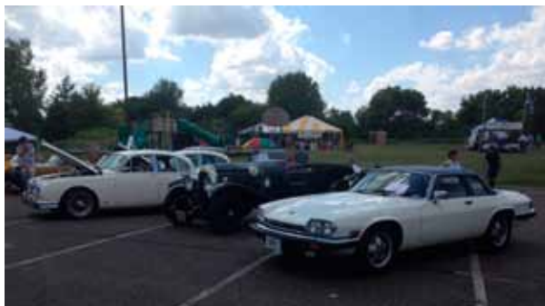
XJS, 1925 Bentley and two club Mark II's