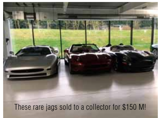
These rare jags sold to a collector for $150 M!