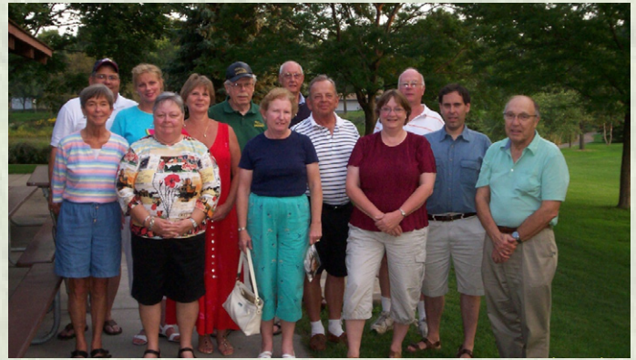
A fine collection of happy picnickers