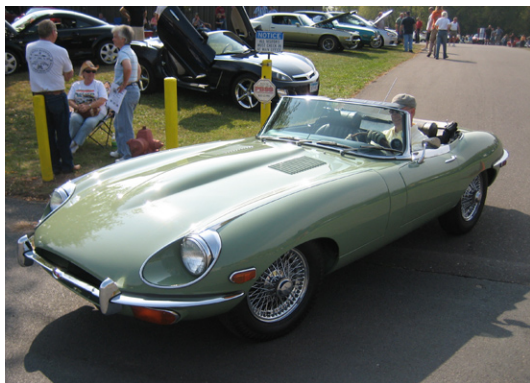
A nice willow green roadster

There were only about 5 Jaguars present. Its possible others were there, but not in the central area near the warehouse. I learned later that entire Citroën club had been herded into an outlying parking