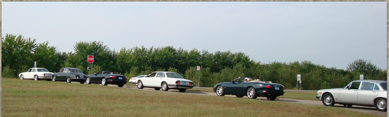
Jags on the move