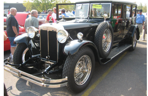
This 1928 Daimler (British, not German) is a P 150 F Front, and is the only one in existence