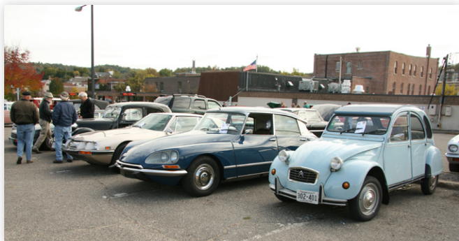
The Citroen Club made an appearance