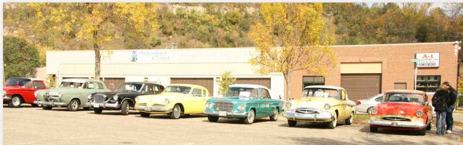
Looks like a line of Studebakers