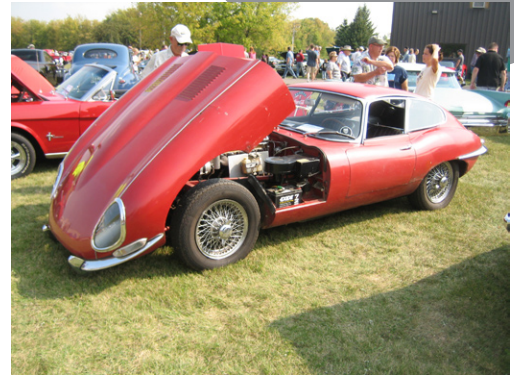
Looks like Harvey Bergquist's E Coupe