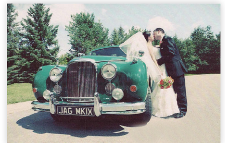
The bride and groom no doubt mesmerized by the Chadfield's MK IX!