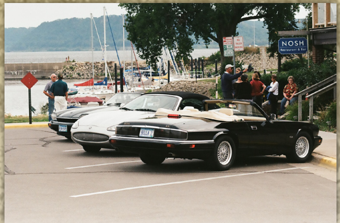
Lined up in front of the NOSH Restaurant

This was truly a great day and wonderful event!