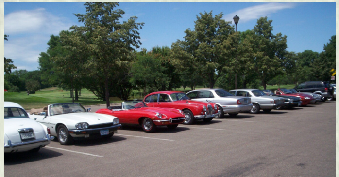
British Iron Flanking the Golf Course