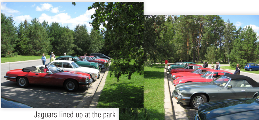
Jaguars lined up at the park